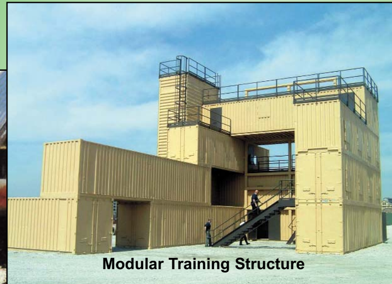
Modular Training Structure