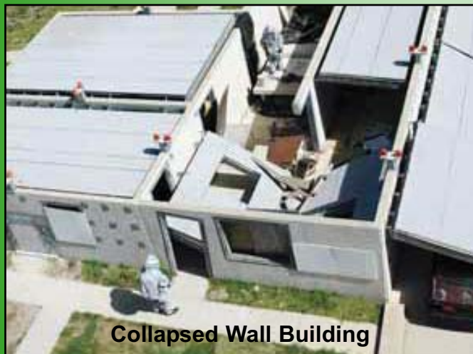
Collapsed Wall Building