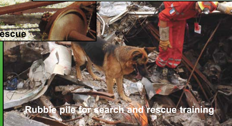
Rubble pile for search and rescue training